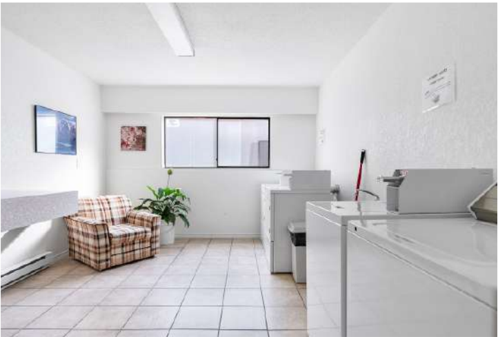
COMMON AREA - LAUNDRY