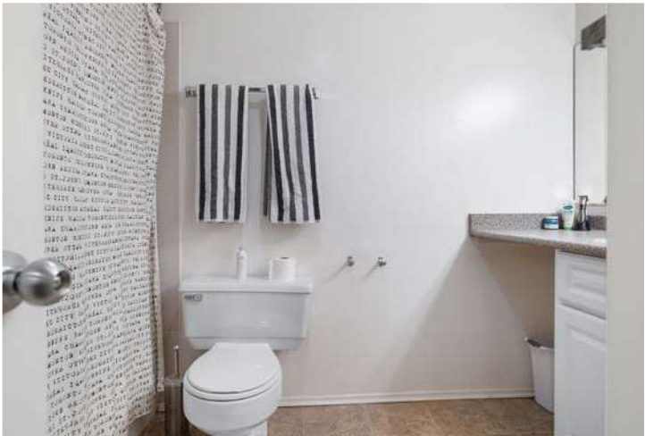
SUITE - BATHROOM