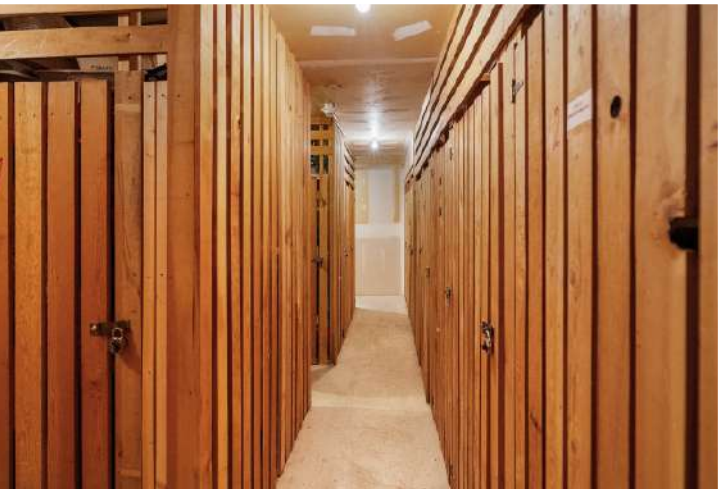
COMMON AREA - STORAGE