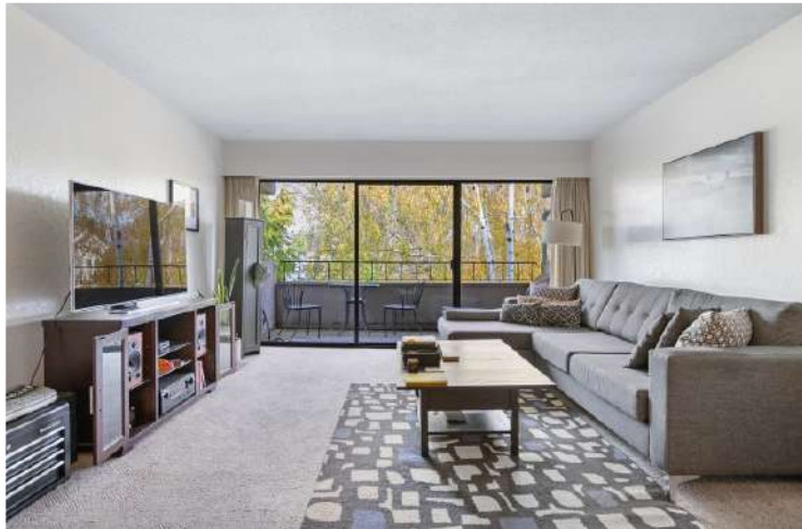
SUITE - LIVING ROOM