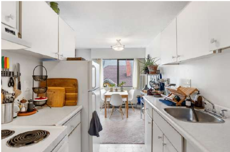
SUITE - KITCHEN