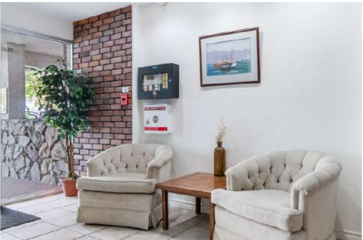
COMMON AREA - LOBBY