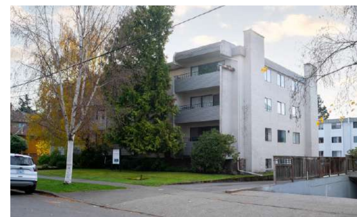
WEST SIDE OF BUILDING