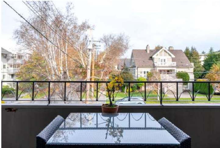
SUITE - BALCONY