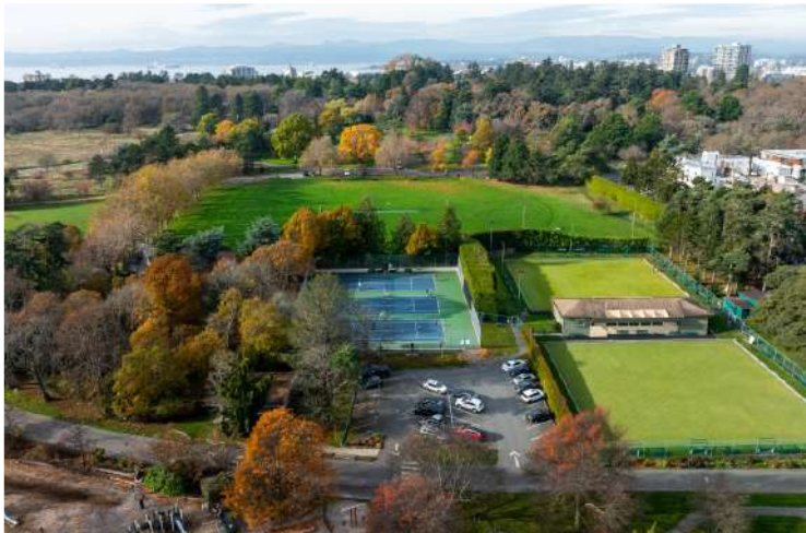
BEACON HILL PARK