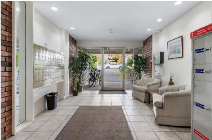
COMMON AREA - LOBBY