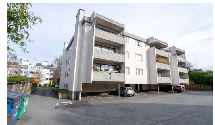
BACK OF BUILDING / PARKING